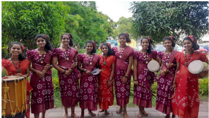
Nadan Pattu- 2nd Prize

The C-zone arts festival of Calicut University 'Kalotsavam-C-Zone 2023' was held at Ponnani MES College, Malappuram from 22nd May to 26th May 2023. Even though summer vacation interrupted the rhythm of practice and learning students along with the Fine Arts Co-ordinators and Union members took all efforts to participate in various competitions and to win a handful of prizes. The following prizes were bagged by our students with A grade.